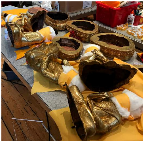
Filling each part of the statue with specific mantras rolls.