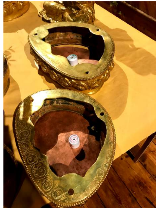
Mantra Rolls for each part of the statue.