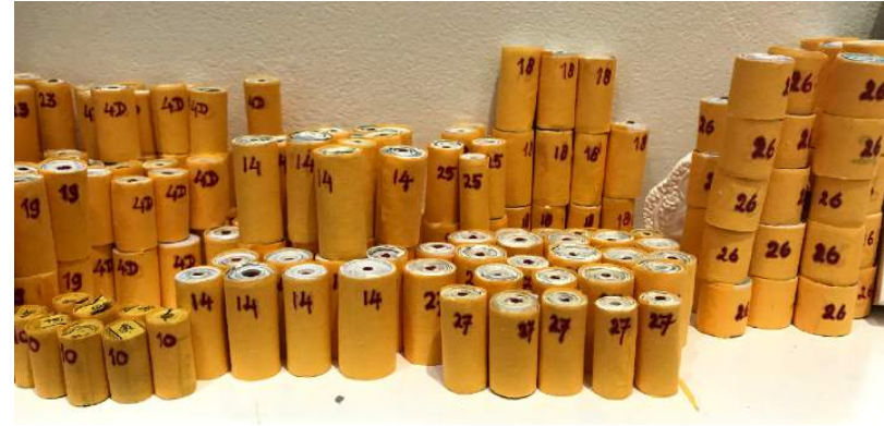
Filling the lotus throne with specific mantras rolls, and other special items such as precious stones.