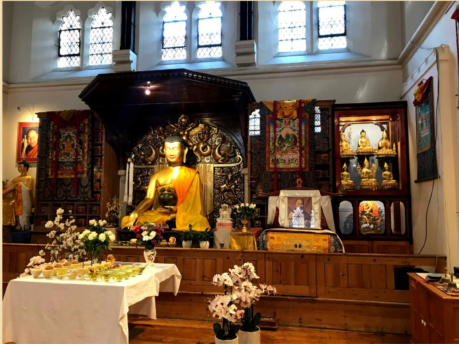
The final result, the new statues in the Main Compa.